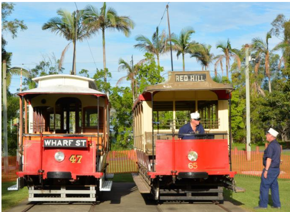
Brisbane's early electric trams

The 2025 COTMA conference will be held in Brisbane.