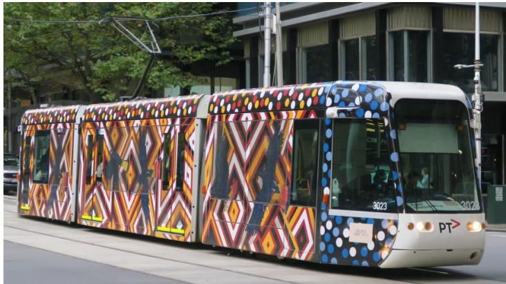
The 2022 version of Lin Onus' tram.

929 has been given to the Ballarat Tramway Museum where it will join the original art tram painted by Clifton Pugh.