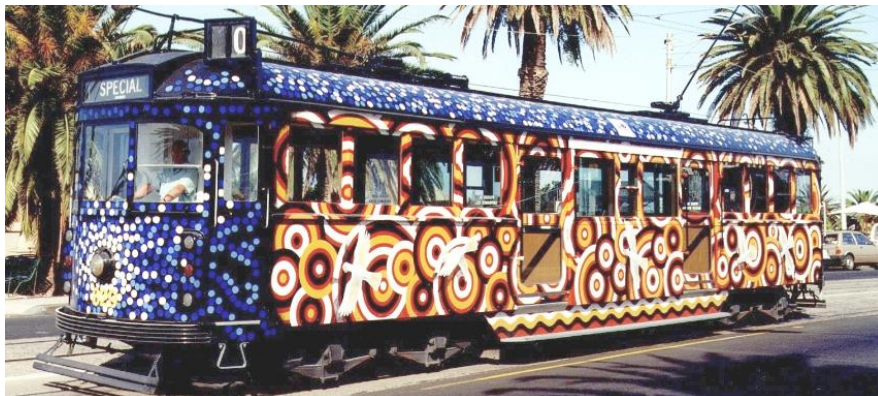
Melbourne Art Tram 829 – Lin Onus